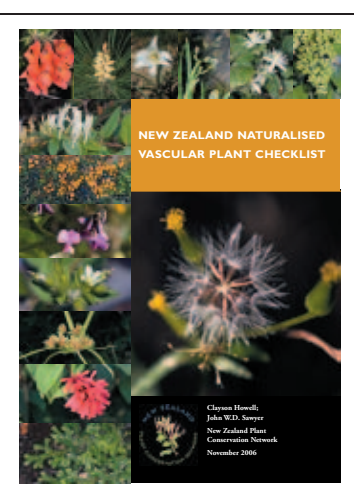
Members: $14.00 Non-members: $18.00