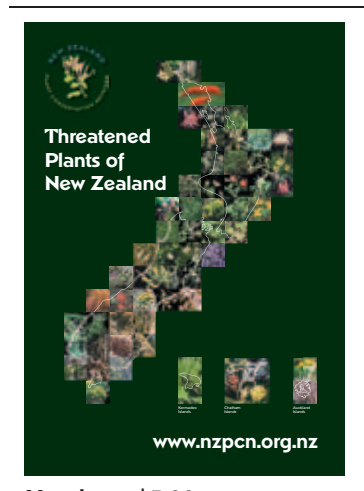
Members: $5.00 Non-members: $8.00