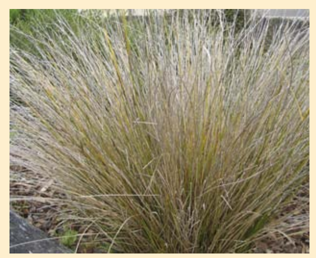
Uncinia strictissima.

Plant of the month for May is Uncinia strictissima. This endemic sedge forms rush-like tufted clumps up to 700 mm tall with thin dark olive-green to red-green leaves.