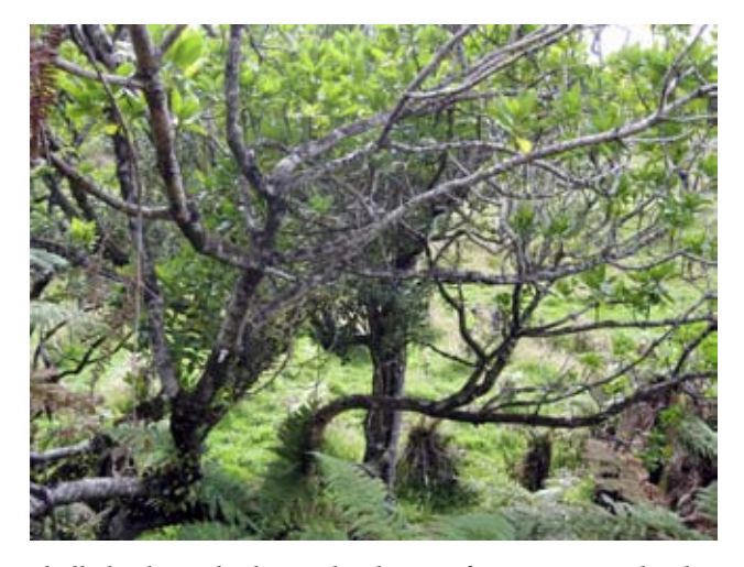
Shell akeake / Chatham Island ngaio forest on Pitt Island.