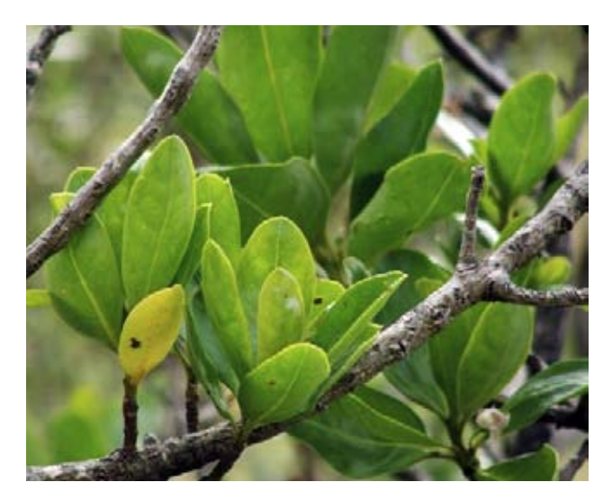
Chatham Island ngaio ( Myoporum semotum ) foliage. Pitt Island.

name "semotum" meaning "distant, far removed" refers to this species' geographic isolation from the New Zealand ngaio ( M. laetum ). Even more pleasing is that the world expert on the genus, Bob Chinnock, is delighted by the discovery and fully convinced of the species' distinctiveness. It's nice to know that our cautious approach to the Chatham Island Myoporum "problem" has paid off.