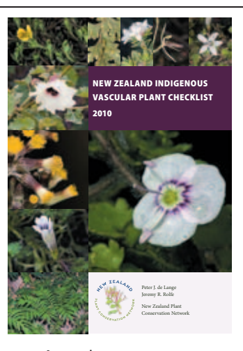
Members: $18.00 Non-members: $25.00