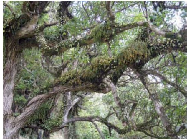
Chatham Island ngaio ( Myoporum semotum ) trunk and branches. Pitt Island.

Our conclusions have just been published in the New Zealand Journal of Botany (Heenan & de Lange 2011) where the new Chatham Islands ngaio is described as Myoporum semotum . The new species is distinguished from Myoporum laetum by its smoother bark; usually wider leaves; by the leaf secretory cavities being obscure, smaller and denser; by the midrib, petioles and branchlets being smooth and lacking prominent protruding tubercules; and also by the slightly larger flowers. The