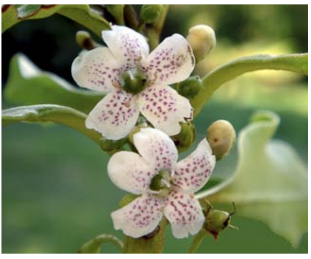
Chatham Island ngaio ( Myoporum semotum ) flowers. November, Pitt Island.

As far as we can tell, Myoporum semotum is naturally endemic to Pitt Island and the smaller islands that surround it. We have seen and/or collected material from Rabbit, Mangere and South-East Islands and seen images of it from Little Mangere. The new species is inexplicably absent from Chatham Island from where we have only seen New Zealand ngaio and that only from sites suggesting that it is not native to the islands. The formal recognition of M. semotum brings to 37 the total number of endemic ferns and flowering plants now known only from the Chatham Islands. It is noteworthy that the new species is also a rather large tree, demonstrating that new species need not be obscure little herbs and grasses, and that all it takes is a critical eye to find something new on the Chathams. The last such discovery, also first recognised by Peter Heenan, was Olearia telmatica (Heenan et al. 2008), although there, of course, Chatham Islanders had long recognised its distinctiveness. This makes M. semotum all the more noteworthy, because it seems no one had previously remarked on the possibility of ngaio plants on the Chathams being potentially distinct from New Zealand ones.