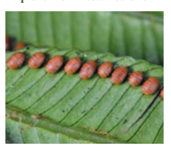
Members: $35.00 Non-members: $40.00