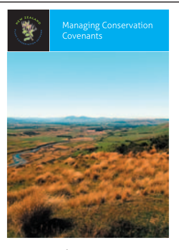
Members: $30.00 Non-members: $36.00