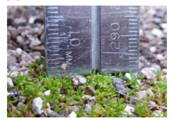
Crassula peduncularis showing elongated pedicel, in cultivation.

us was keen to attach a species name to it. It wasn't until a sample I grew in my garden flowered and produced seed that it could be confirmed as Crassula peduncularis . Interestingly, when grown away from the influence of salt, the Crassula greens up. This species is nationally critical and the closest population is the Pencarrow lakes area.