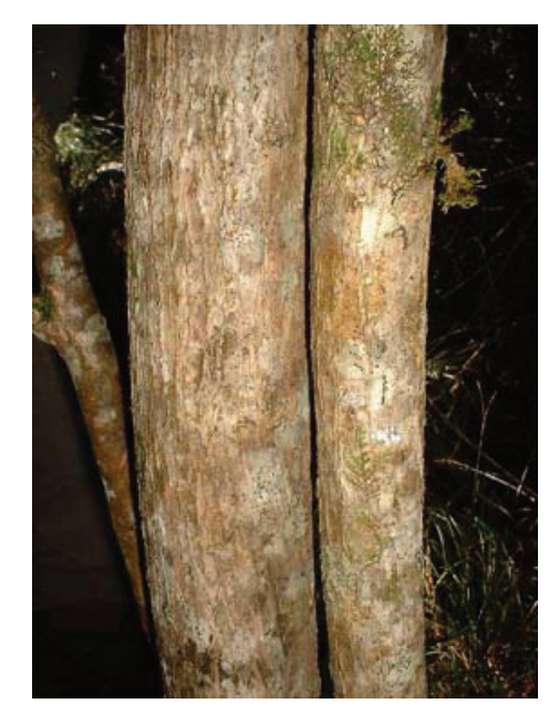
How Can I help?

Nationally Critical. Threats include habitat loss, lack of legal protection for existing sites, animal browsing, weed invasion, lack of seedling recruitment and lack of a functioning ecosystem.