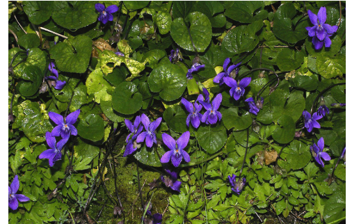
Viola odorata.