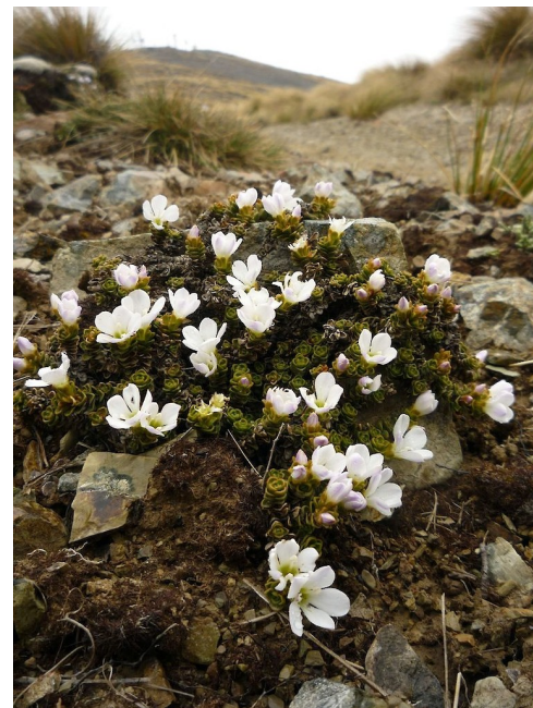
Mid Dome, Southland. Date taken: 27/11/2010, Licence: CC BY-NC.