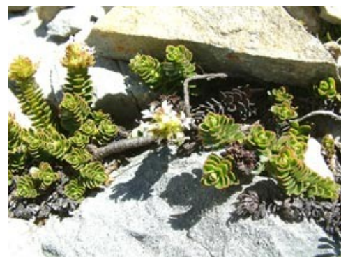
Mt Peel, Nelson, January.