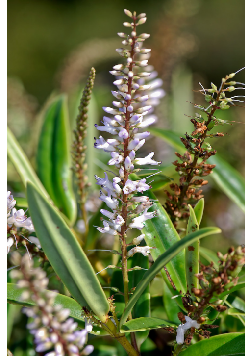
In cultivation.