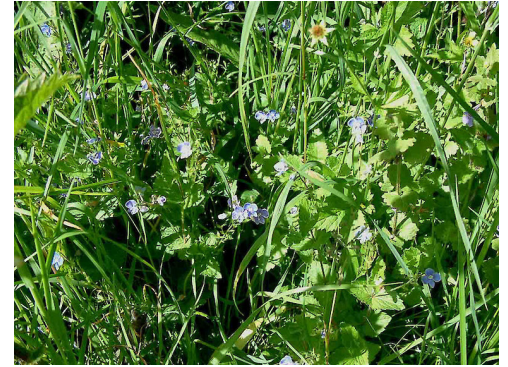
Veronica chamaedrys.