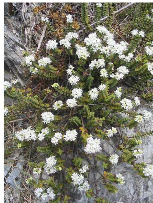
Hebe buchananii, Kyeburn.