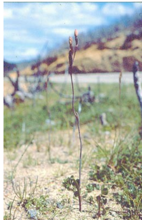
Seeding plant, Little Bay, Coromandel. Photographer: John Smith-Dodsworth, Licence: CC BY-NC.