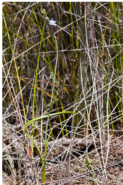
Lake Ohia. Photographer: Jeremy R. Rolfe, Date taken: 30/10/2008, Licence: CC BY.