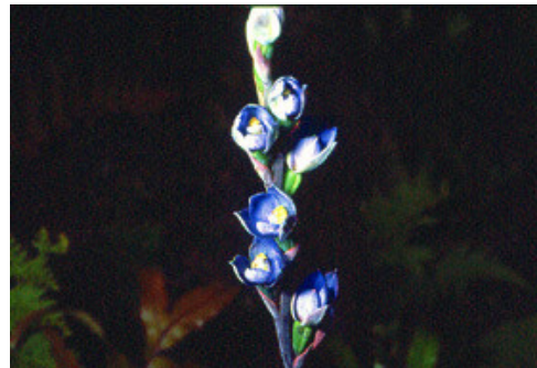
Kennedy Bay. November.