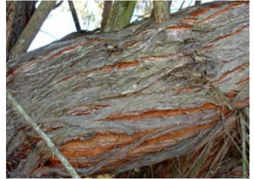
The bark of Taxandria juniperina, Dover Road, St Andrews, Hamilton.