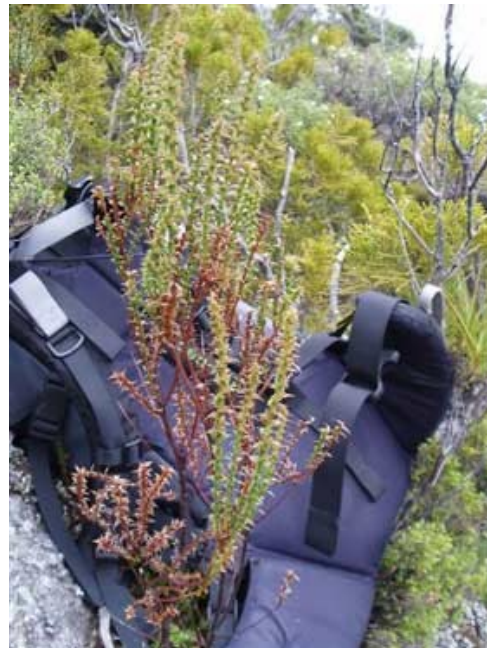
Sprengelia incarnata . Photographer: Sue Lake, Licence: CC BY-NC.