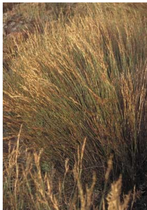
Sporadanthus traversii restiad bog, Taia, Chatham (Rekohu) Island, July 2002.