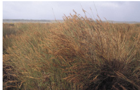
Sporadanthus traversii restiad bog, Taia, Chatham (Rekohu) Island, July 2002. Photographer: John Sawyer, Licence: CC BY-NC.