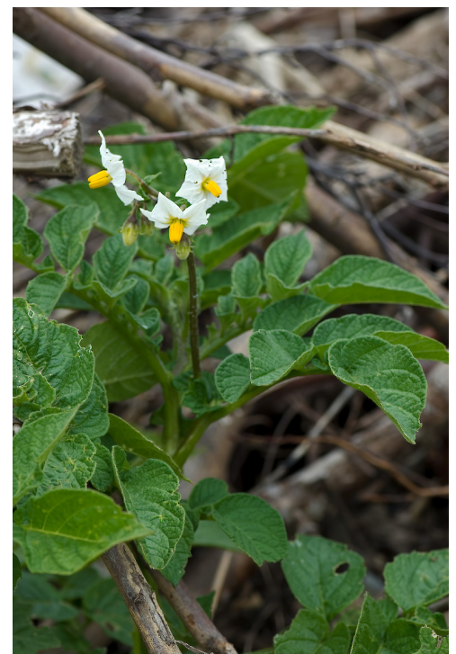
Garden discard. Silverstream, Upper Hutt.