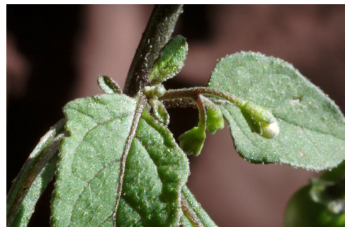
Newtown, Wellington. Photographer: Colin C. Ogle, Date taken: 22/04/2009, Licence: CC BY-NC.