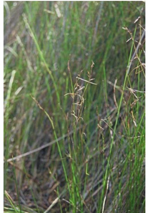
Schoenus carsei at Whangamarino. Photographer: Bec Stanley, Licence: CC BY-SA.