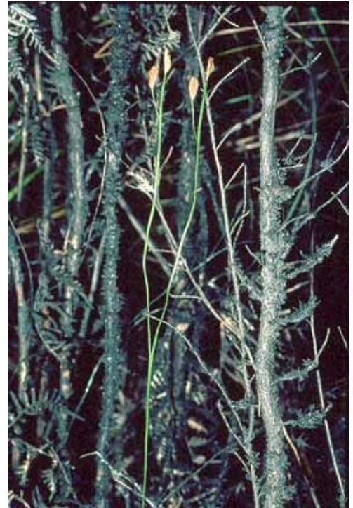
Kennedy Bay.