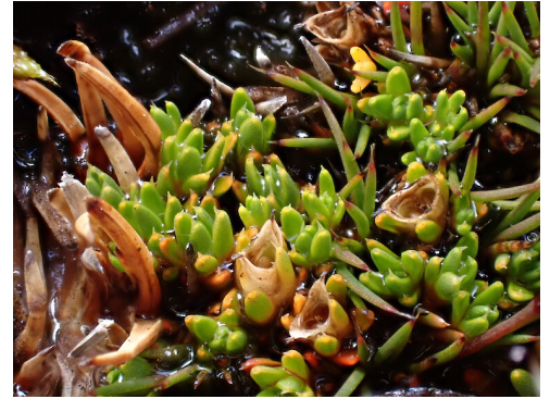
Arthur's Pass National Park.