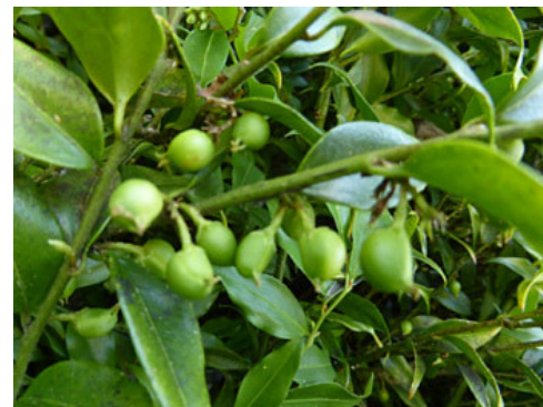
Unripe fruit (abundant seedlings nearby) on planted specimen; garden Bushy Park near Whanganui. Photographer: Colin C. Ogle, Date taken: 10/04/2017, Licence: CC BY-NC.