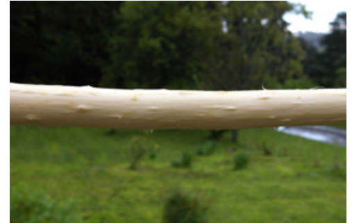
Salix x reichardtii.