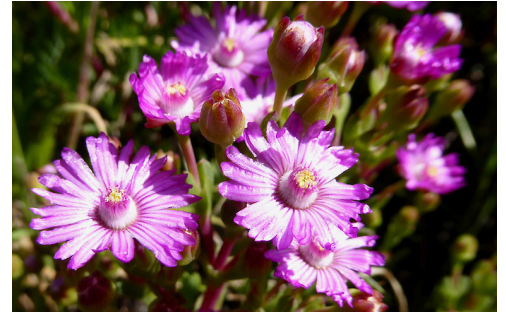
Upright, semi-woody succulent; long-established garden discard in Koitiata dunes, Turakina. Photographer: Colin C. Ogle, Date taken: 03/10/2015, Licence: CC BY-NC.