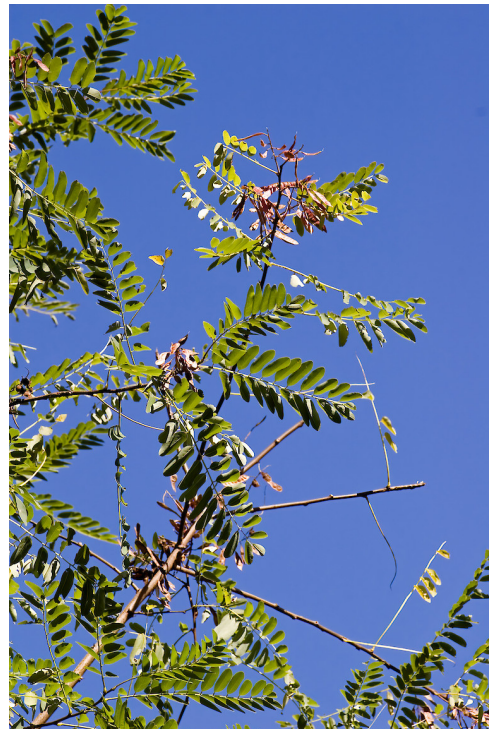
Hutt River Trail north of Stokes Valley.