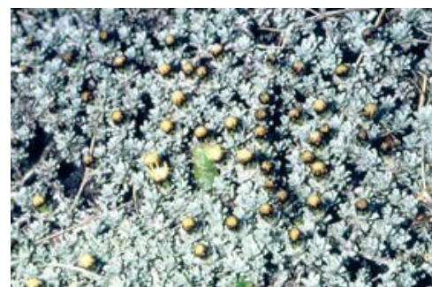
Mt Arthur, February.