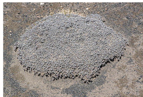
Rangipo Desert.