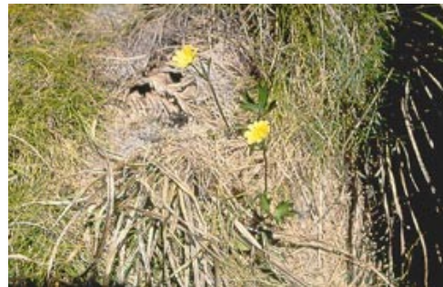
Mt Robert Basin. January.