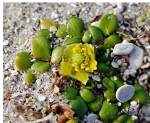
Chatham Island. Sep 2007. Photographer: Peter B. Heenan, Licence: CC BY-NC.