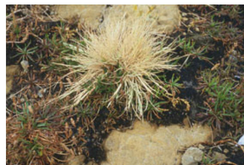
Taputeranga Island, Wellington. Dec 1998. Photographer: Barbara Mitcalfe, Licence: CC BY-NC.