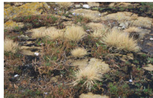
On Taputeranga Island, Wellington. Dec 1998.