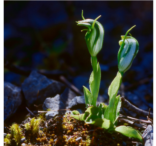
Palliser Bay. Date taken: 23/10/1994, Licence: CC BY.