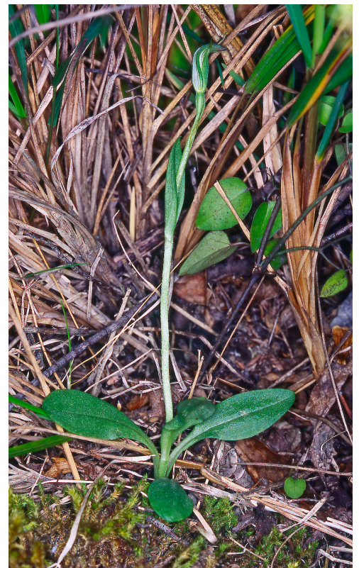
Palliser Bay.