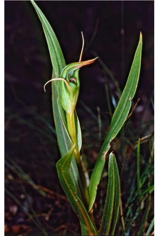
Eastbourne.