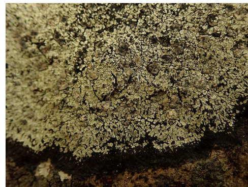
Photographer: Marley Ford, Licence: CC BY-NC.