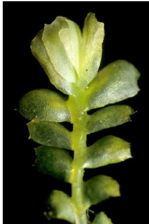
Pseudolophocolea denticulata .