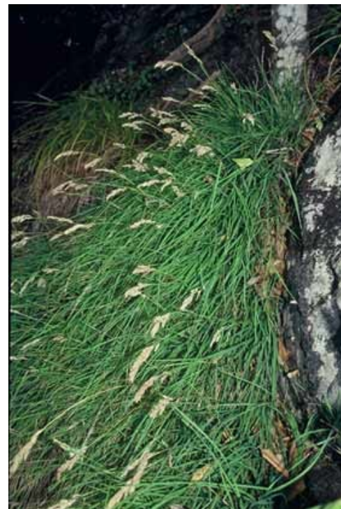
Raoul Island. Photographer: Bec Stanley, Licence: CC BY-SA.