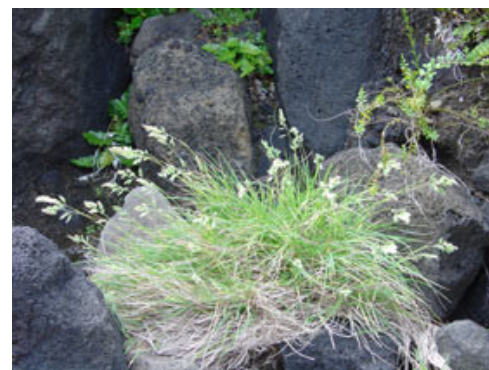
Raoul Island.