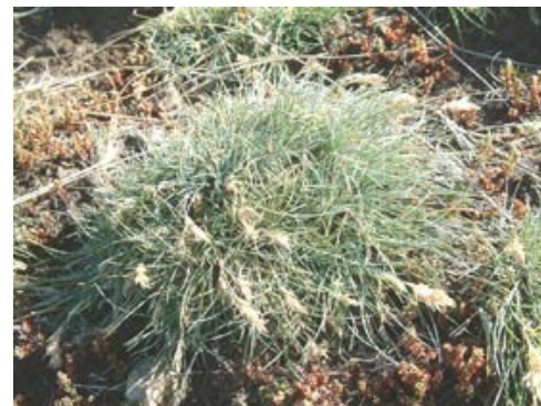
Slope point, January. Photographer: John Smith-Dodsworth, Licence: CC BY-NC.