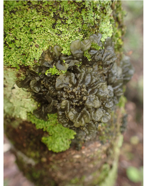
Corticolous, Waima Far North.