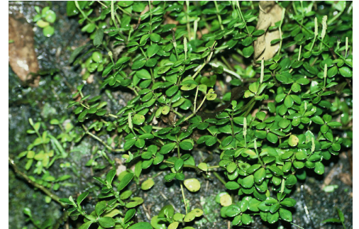
Hicks Bay, Onepoto Bay.