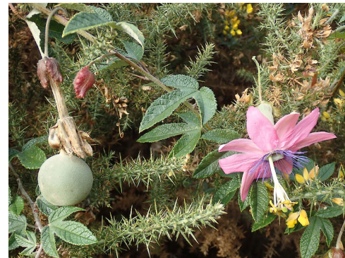
Banks Peninsula. Photographer: Melissa Hutchison, Date taken: 07/05/2021, Licence: CC BY-NC.