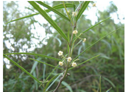
Wairere falls, November.