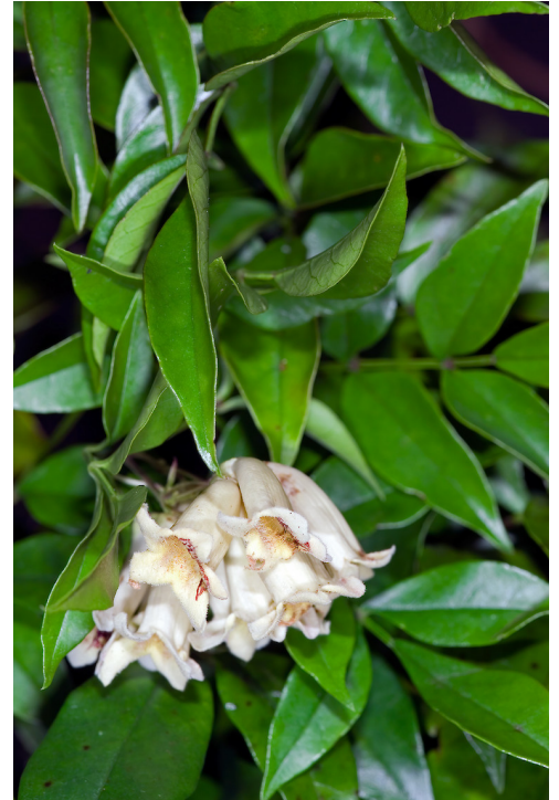
Hayward Scenic Reserve, Lower Hutt. Date taken: 18/12/2006, Licence: CC BY.