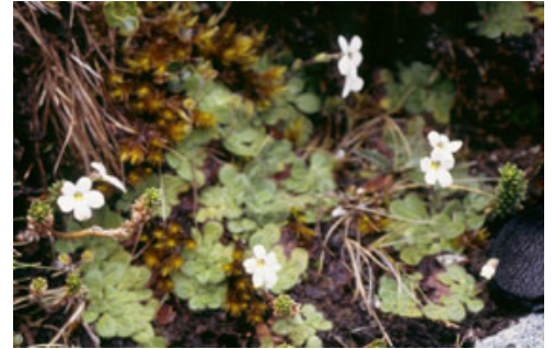
Ourisia. Photographer: Heidi Meudt, Licence: All rights reserved.