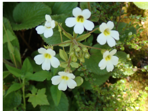
Nelson Lakes National Park. Date taken: 07/01/2022, Licence: CC BY-NC.