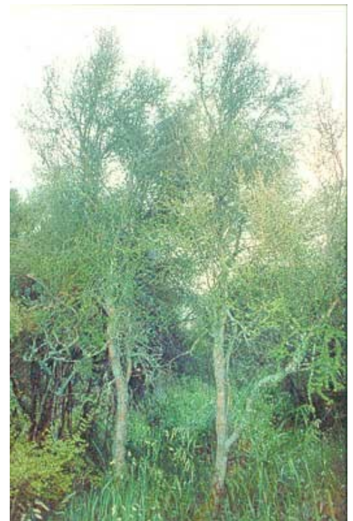
Balls clearing, December. Photographer: John Smith-Dodsworth, Licence: CC BY-NC.