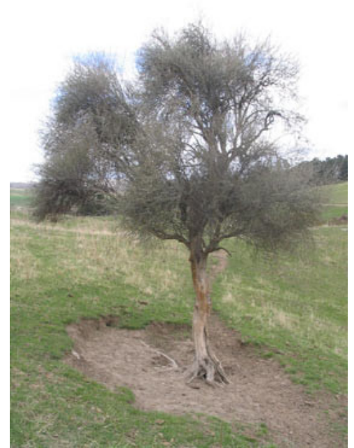
Hyde.