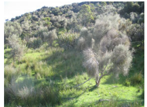
Shrubland, Millers Flat.