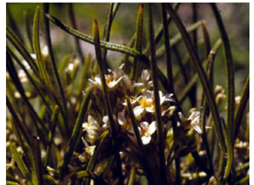
Beatrice Peaks, Princess Range 25th Jan, 1984.