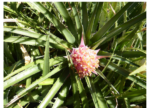
Planted in garden near Fordell, Whanganui. Photographer: Colin C. Ogle, Date taken: 04/03/2018, Licence: CC BY-NC.