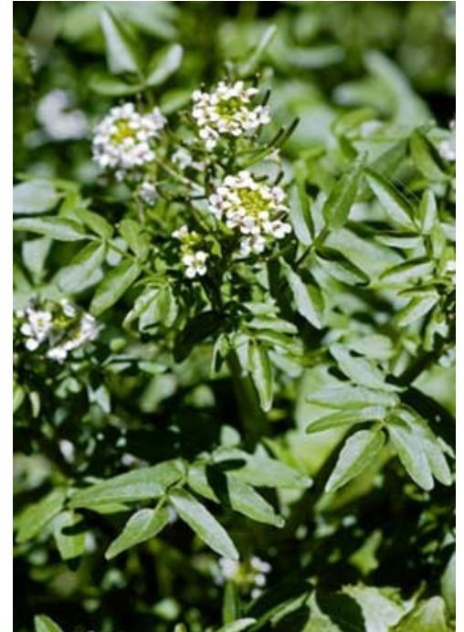
Rimutaka Rail Trail. Dec 2006.