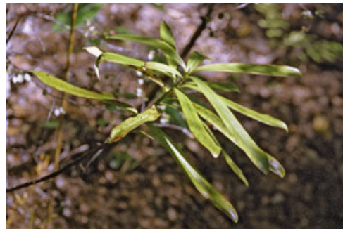
Pinehaven. Jan 2005.