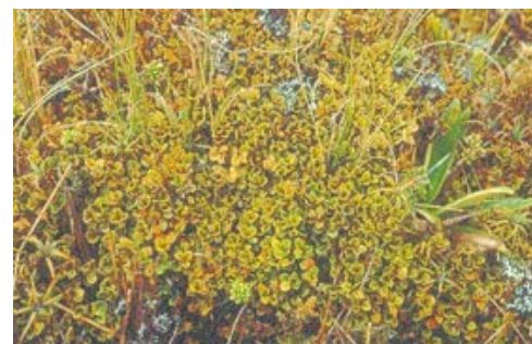
Tongariro, November.