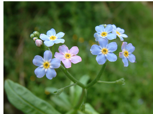
Myosotis scorpioides var. strigulosa.