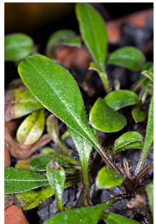
Myosotis laeta foliage In cultivation ex Red Hills. Photographer: Jeremy R. Rolfe, Date taken: 15/03/2007, Licence: CC BY.