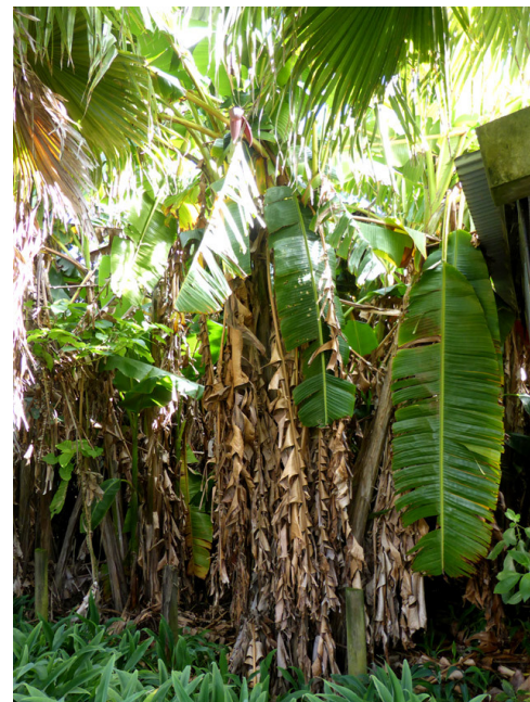
Cultivated; garden near Fordell, Whanganui. Photographer: Colin C. Ogle, Date taken: 29/05/2018, Licence: CC BY-NC.